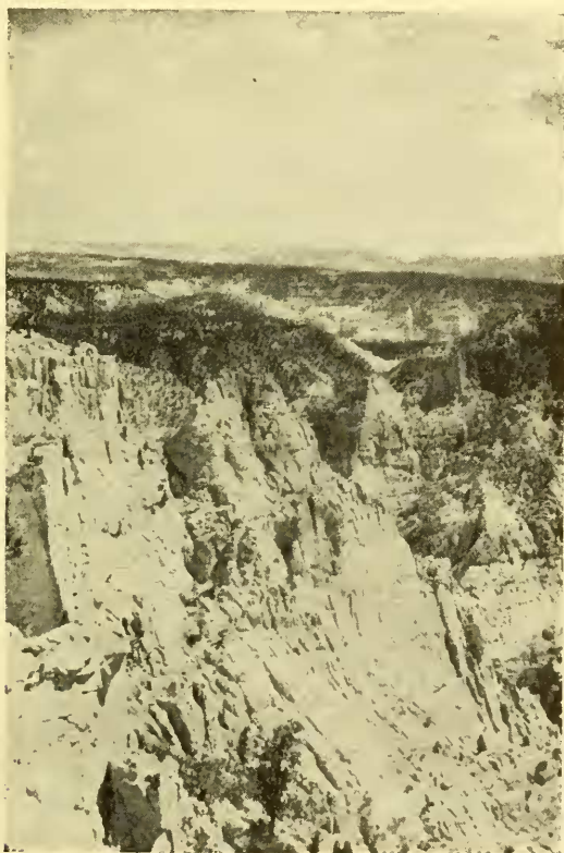
Figure 3. Death Hollow from the Skyline Bridge on the road between Boulder and Escalante. Practically no life is able to maintain itself upon the steep walls.

many of the buffer species between the Lower and Upper Sonoran zones, are encountered. Because of the mixing of the desert and prairie species in what appears to be a rather wide ecotone I prefer to call this the Desert-Prairie community to the Mixed Prairie association now in common usage. This desert may be divided into a number of seral stages. The shifting sands, steep walls of the washes and canyons, and water holes provide many dynamic seral groupings (Figs. 3, 4, 5, 6, 7, and 8). Disregarding these seres at present, but listing